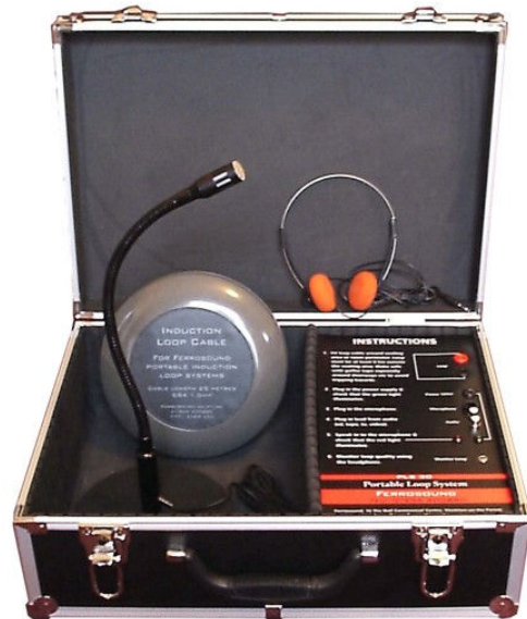
PLS-20/35 Portable Loop System

A Tutorial is provided with all systems, within the Manual supplied and supported by a telephone Helpline . This takes the non-technical operator set-by-step through the setting up procedure, showing how to install, test and monitor the system, so that it conforms to BS EN60118 part 4 and BS7594, in so far as these are applicable to portable systems. We strongly recommend that all operators complete this Tutorial before attempting to set up and operate the system in a public meeting.